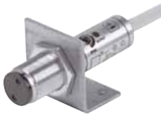
Sensor fitted inside the mounting aid

Using the mounting aid cylindrical sensors are fast and easy to fit. Use the nuts included with the sensor for attachment.